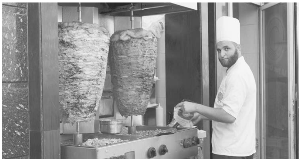
A grill man cook prepares shawerma at a sidewalk restaurant in Cairo, Egypt. Shawerma is a standard street food in the Middle East and now in Europe and North America.

Many kinds of bread are used as sandwich casings for Egyptian meats. The most popular are whole-wheat pita breads, called ‘ eish balady , and white pita bread, or ‘ eish shami . ( Eish means bread, shami refers to the Levant, and balady means country style.) Some vendors also encase the grilled meats in ‘ eish fino , or bread buns—a concept likely borrowed from American hamburger buns.